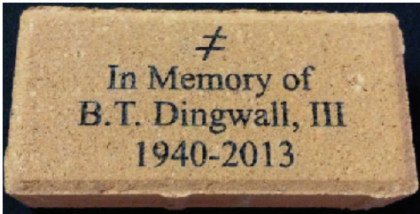
8-INCH BRICK $100.00