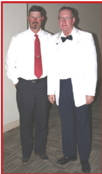
Two of Tucson's finest!