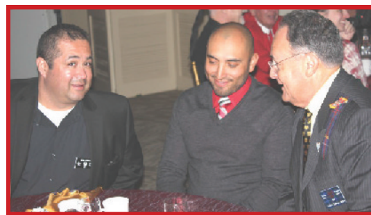
Not sure we want to know what this conversation is about!