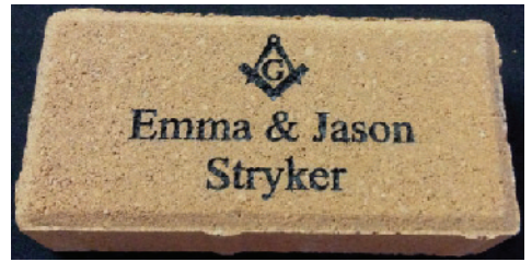
8-INCH BRICK $100.00

Each 8" brick is limited to 3 lines and 18 characters per line, plus a logo. The 12" x 12" brick has fewer limitations. Personal logos as well as most Masonic logos are available, such as: