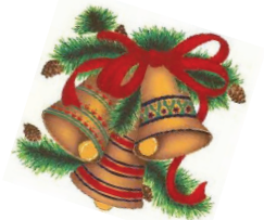
Entertainment provided by Tucson Desert Harmony