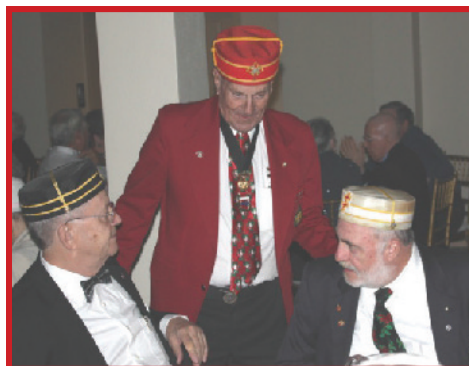
No Stated Meeting tonight, guys!