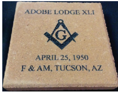
12 X 12-INCH BRICK $500.00